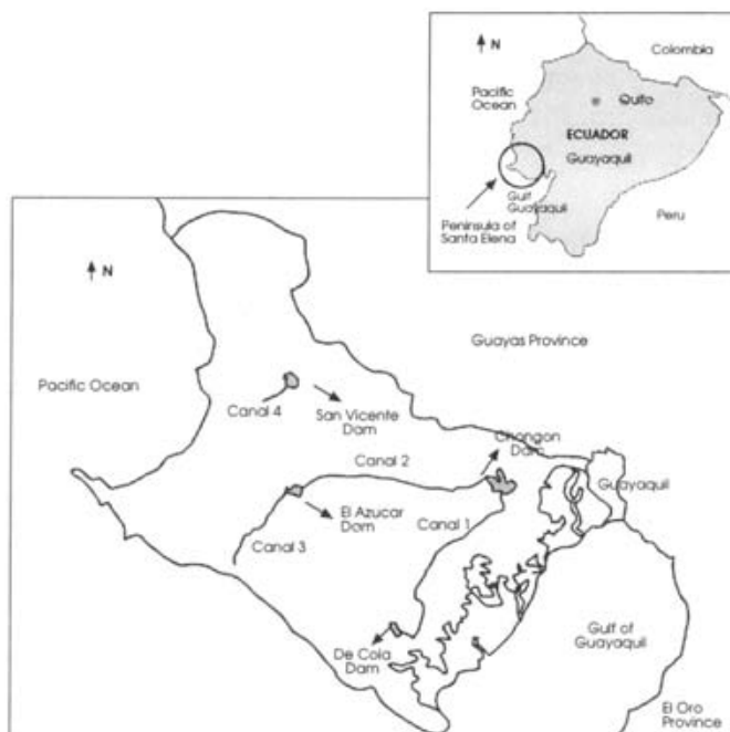
Figure 1: Peninsula of Santa Elena and Works of the Hydraulic Project Santa Elena Aqueduct completed so far